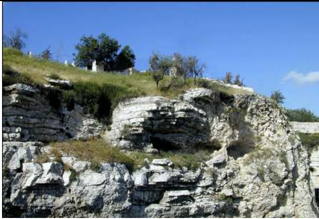
Mt Calvary - Golgotha

On the Mount of Calvary (Golgotha), Jesus was crucified. His Mother and John were near Him. It was almost noon when they crucified Him.