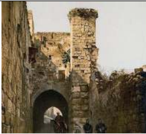
The Tower of Antonia

In the Fortress and Tower of Antonia lived Pilate, the Roman governor. The authorities took Jesus there because the Jews could not condemn someone to death. They accused Him of being an evil-doer.