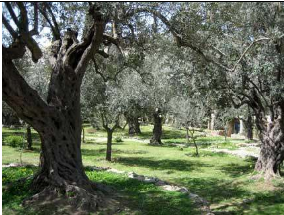
The Garden of Olives - Gethsamane

While they were eating he took bread, blessed it and gave it to them saying "Take and eat. This is my body."" At the end of the meal He took the chalice of wine. He blessed it, gave it to his apostles saying, "This is my blood."