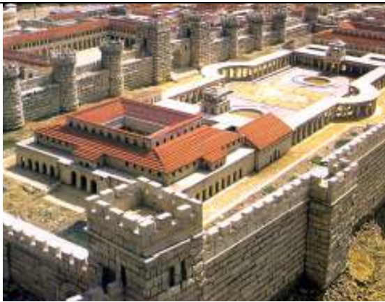
Palace of Herod

In the Fortress and Tower of Antonia lived Pilate, the Roman governor. The authorities took Jesus there because the Jews could not condemn someone to death. They accused Him of being an evil-doer.