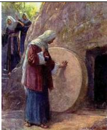
He is risen!

After He dies, Jesus is put into the tomb.