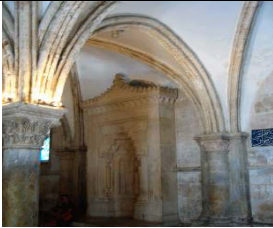
The Cenacle - The Upper Room

In the Cenacle , Jesus gathered with his apostles to celebrate Passover according to the custom of the Jews.