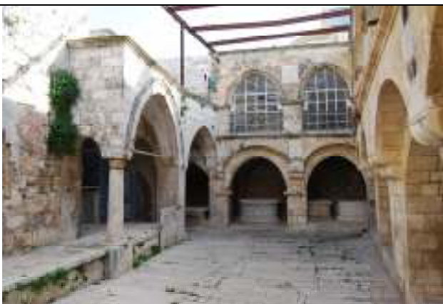
The House of Caiaphas

In the Garden of Olives ( Gethsemane ), a group came to arrest Jesus while he prayed. It was the "hour of trial" and his own abandoned Him.