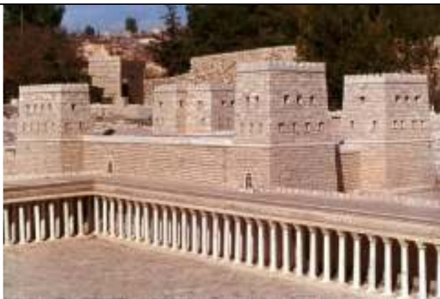
The Antonia Fortress (The Praetorium)

In Herod's palace live Herod Antipas, Tetrach of Judea. He also questioned Jesus, but Jesus did not want to answer him anything.