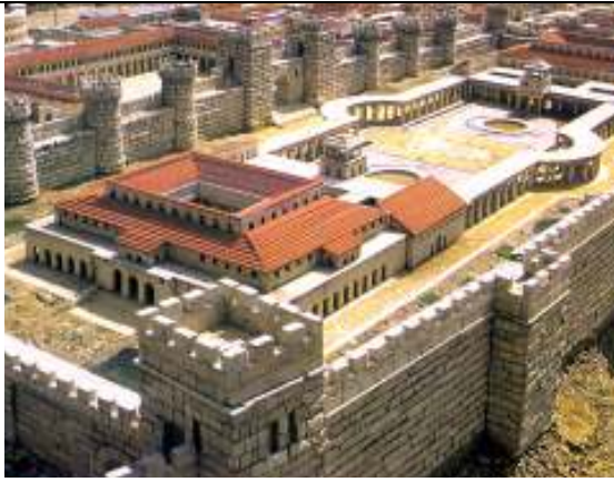
Palace of Herod

At Herod's Palace, Jesus does not answer the questions asked by Herod Antipas.