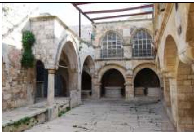
The House of Caiaphas

In the Garden of Olives, Jesus is arrested while He is praying.