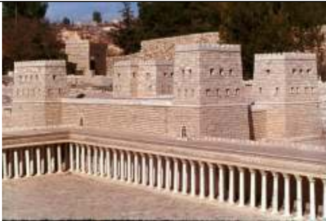
The Antonia Fortress (The Praetorium)

At Herod's Palace, Jesus does not answer the questions asked by Herod Antipas.