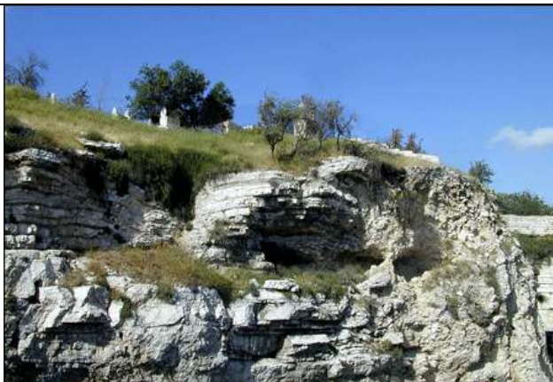
Mt Calvary - Golgotha

At the Antonia Fortress, Jesus is handed over to the soldiers by Pilate in order to be crucified.