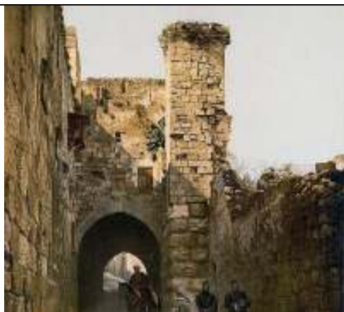
The Tower of Antonia

At the house of Caiaphas, Jesus says that He is the Christ, the Son of the Living God. He is accused of being a blasphemer who deserves to die.