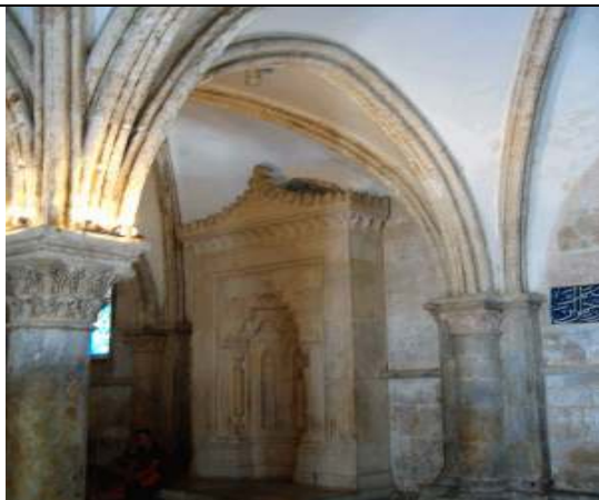
The Cenacle - The Upper Room

At the Cenacle, Jesus celebrates the Last Supper with his disciples